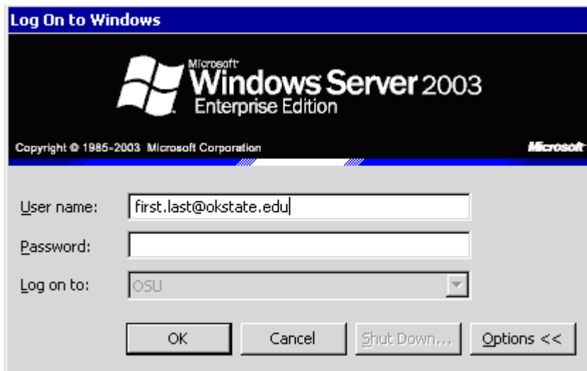
Figure 2: Log On to Windows